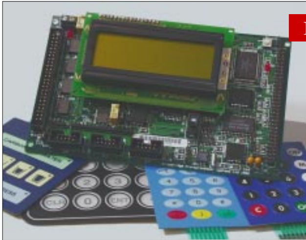
The picture shows the FM-600P Controller with a 4 x 20 LCD and a number of custom keypads

42 Digital I/O 18 Analogue I/O LCD & Keypad